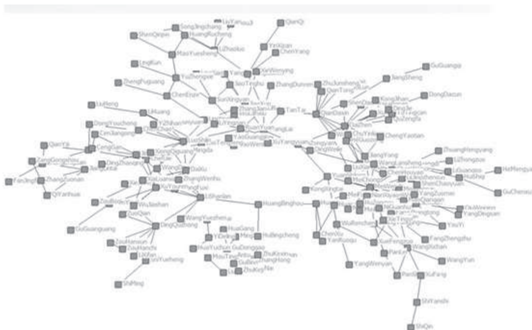
Graph 1. The social network of chouren in Qing Dynasty.